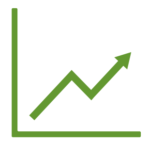
2. Business Support Experience planning