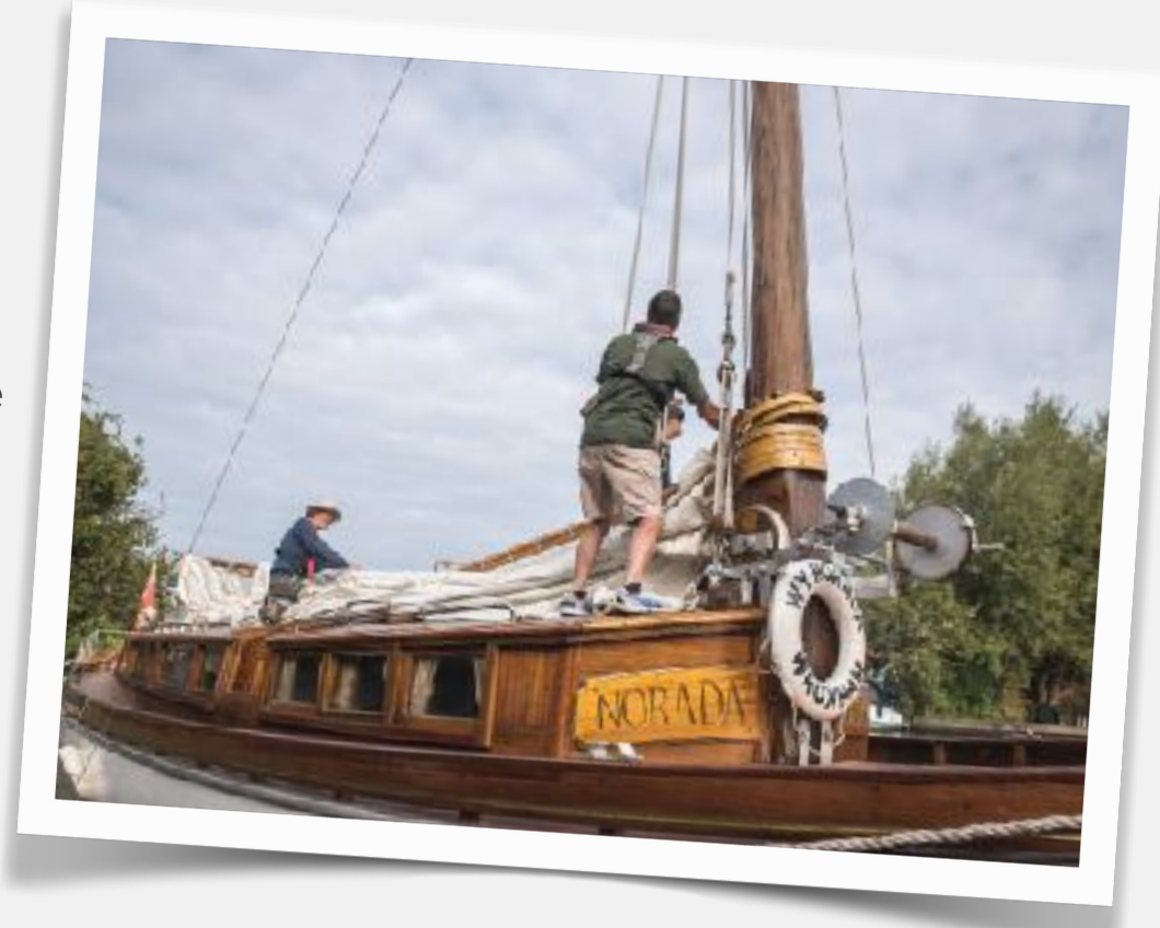
5-7 hours | £58 per person