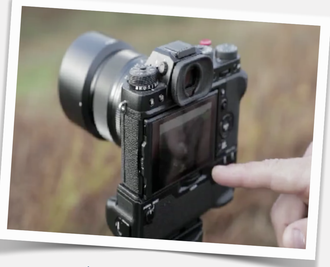
4 hours | Cost per person £155